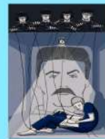
( "1984" ).

In 1984 the capacity of thought to benefit the government and the totalitarian regime is reduced. On the other hand, at present the implementation of these new technologies does not benefit anyone in particular but is like the future.