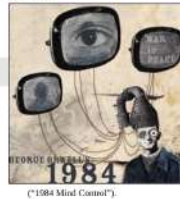
( "1984 Mind Control" ).